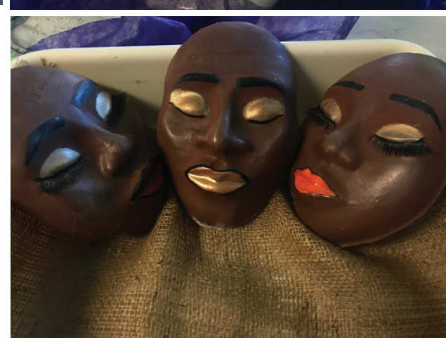
The pictures above show pieces of art created by jada Walker