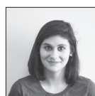
by Destiny Robinson

Move over achieve here's the new CCR program. The College and Career Readiness development idea was created by the administrators to address the problems that faced the school's current achieve program. The issue was that students weren't using the time they were given to actually get any work done. Playing games and socializing with friends seemed to be the only thing that students were interested in doing. The new plan includes more group participation and listening activities.